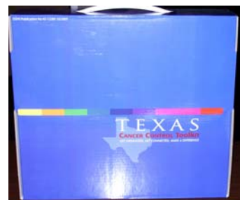
The Texas Cancer Control Toolkit.

Open-ended survey responses suggested a desire for additional training geared toward program evaluation and development of logic models. Workshop participants suggested that useful additions to the Toolkit could include more information about financial resources, a screening checklist for providers (i.e., "a toolkit for doctors"), and creating a "resources" section to provide a model for the creation of local community resource handouts.