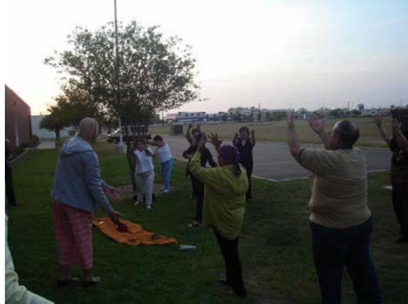
(Pictured above: Movement for Healing workshop participants.)

El Paso presented two workshops. The first workshop was held at the South Texas College School of Nursing and Allied Health and was dedicated to medical professionals. In the evening, she presented at the UTMB Clinic to cancer survivors and their caregivers at the breast and cervical cancer support group. The participants in both groups learned wellness modalities that included Tai Chi movement meditation and simple massage practices. These practices empower individuals to participate actively in their own healing process by regaining and maintaining balance of body, mind, and spirit. Capacitar International is a non-profit organization founded by Pat Cane, Ph.D., who integrates healing practices with a research-based focus. The result is an experience that is truly holistic, incorporating body, mind, and spirit. Capacitar is an international network of empowerment and solidarity working in the U.S. and in 26 countries including Mexico, Latin America, the Caribbean, Africa, Asia, and Europe. For more information on this workshop you can contact Norma Castillo at (956) 686-8321 or email nlcastilo@utmb.edu or contact Isabel at isabelolaque@elp.rr.com .